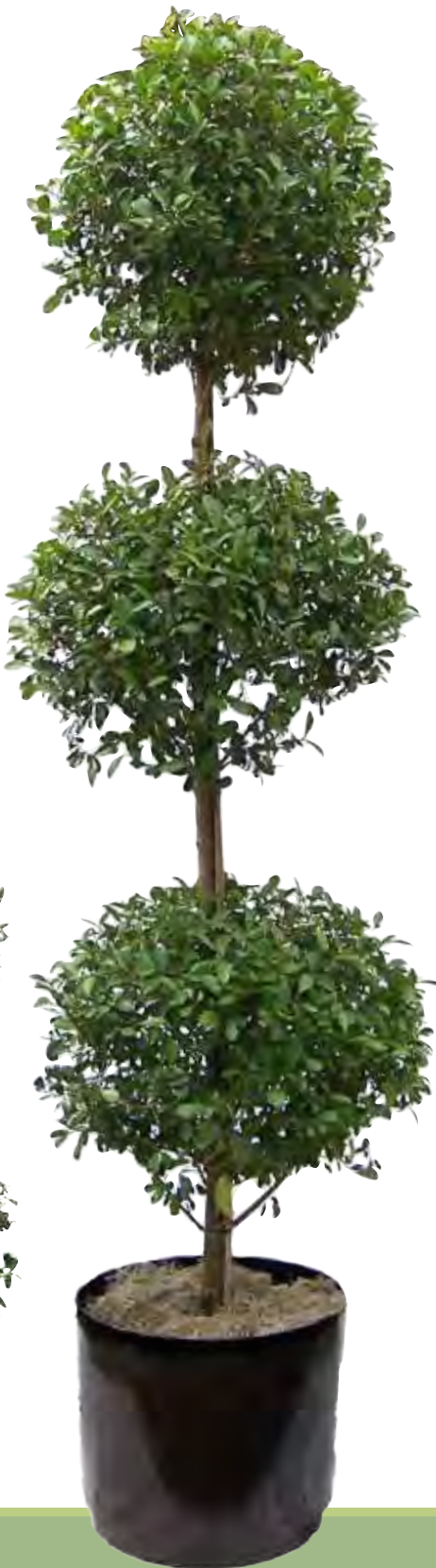
3 BALL TOPIARY EUGENIA