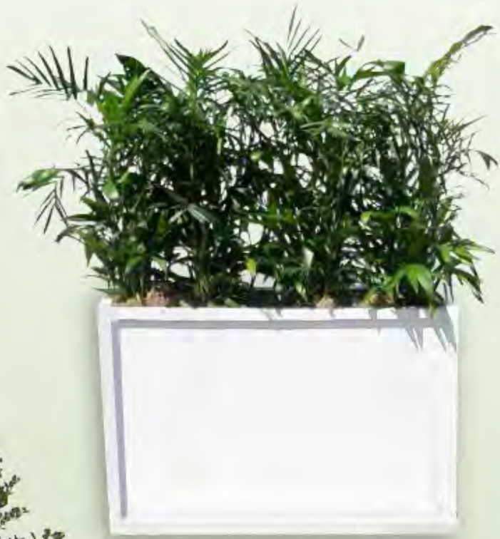
4' BAMBOO WITH 4' WIDE X 3' TALL PLANTER