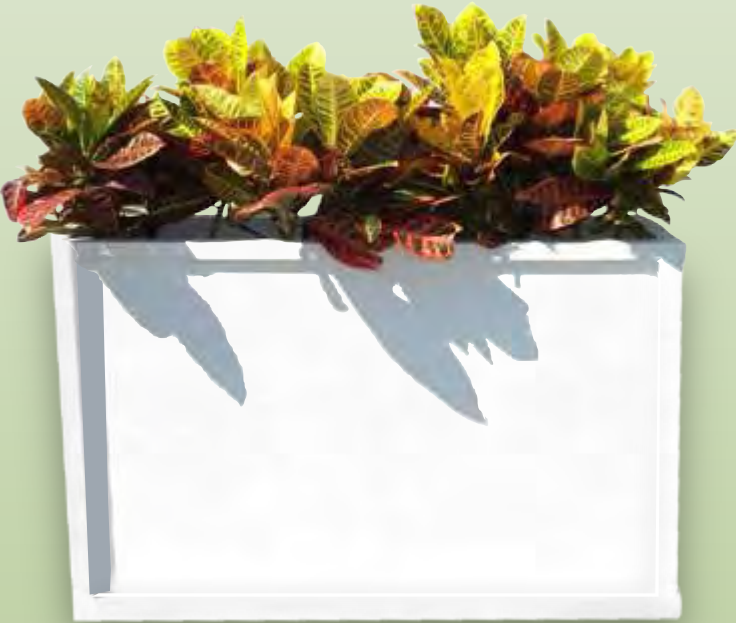
2' to 3' CROTON WITH 4' WIDE X 3' TALL PLANTER