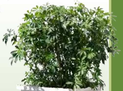
4' ARBORICOLA WITH 2' WIDE X 4' TALL PLANTER