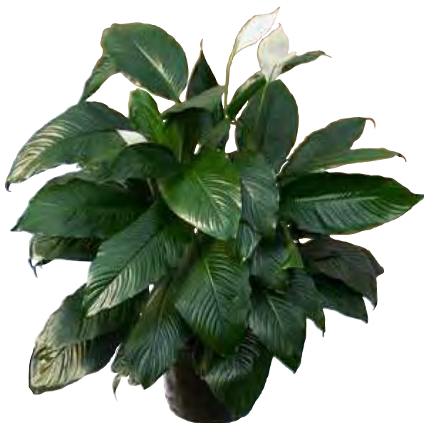
3' SPATH ( PEACE LILLY )