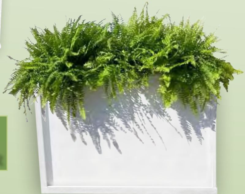
8" to 10" FERN WITH 4' WIDE X 3' TALL PLANTER