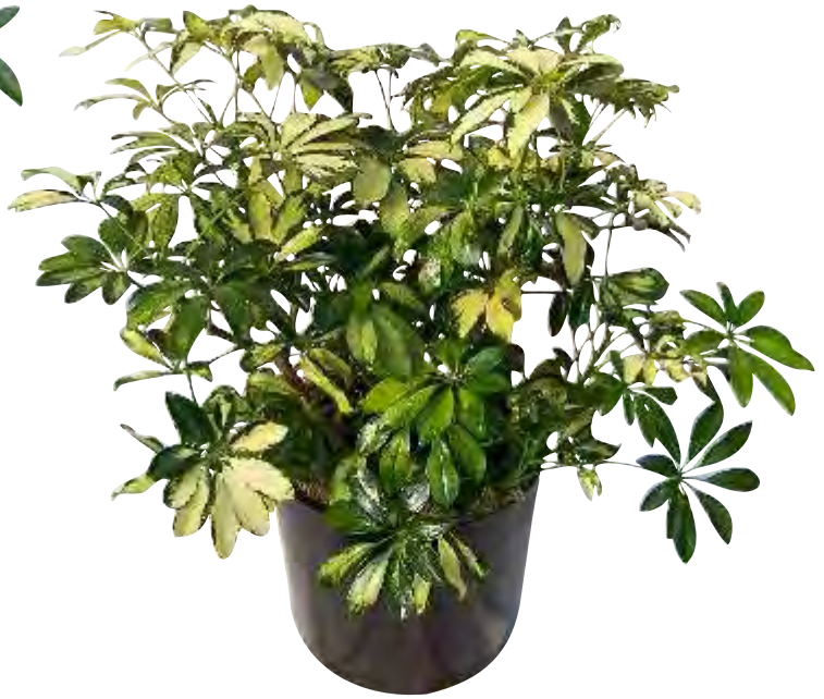
3' VARIEGATED ARBORICOLA