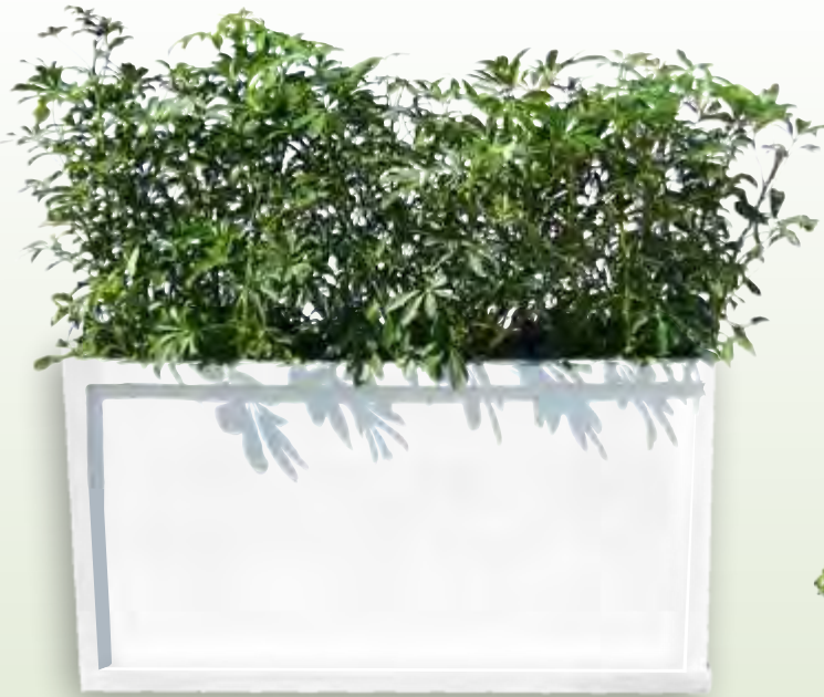
4' ARBORICOLA WITH 4' WIDE X 3' TALL PLANTER