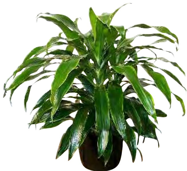
3' JANET CRAIG