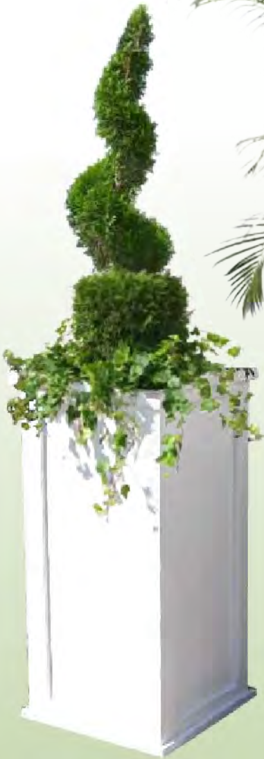
5' to 6' SPIRAL WITH 2' WIDE X 4' TALL PLANTER