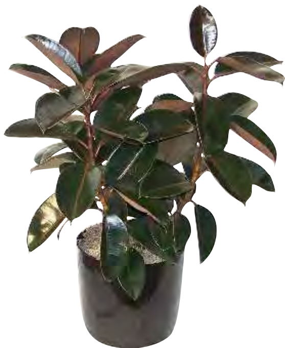
3' DECORA ( RUBBER )