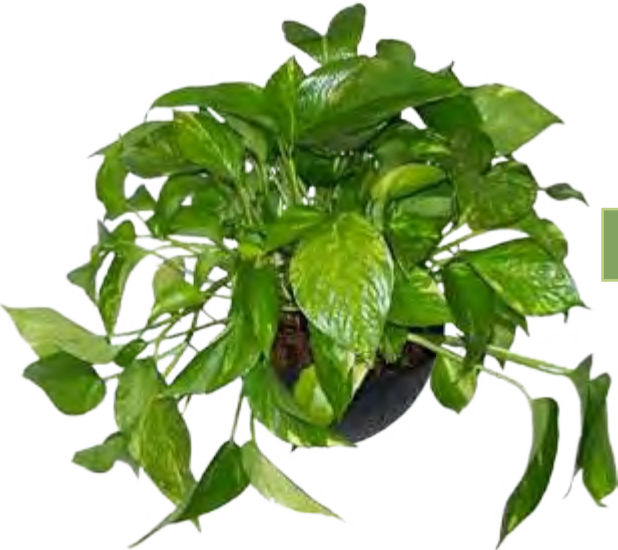
8" LARGE POTHOS