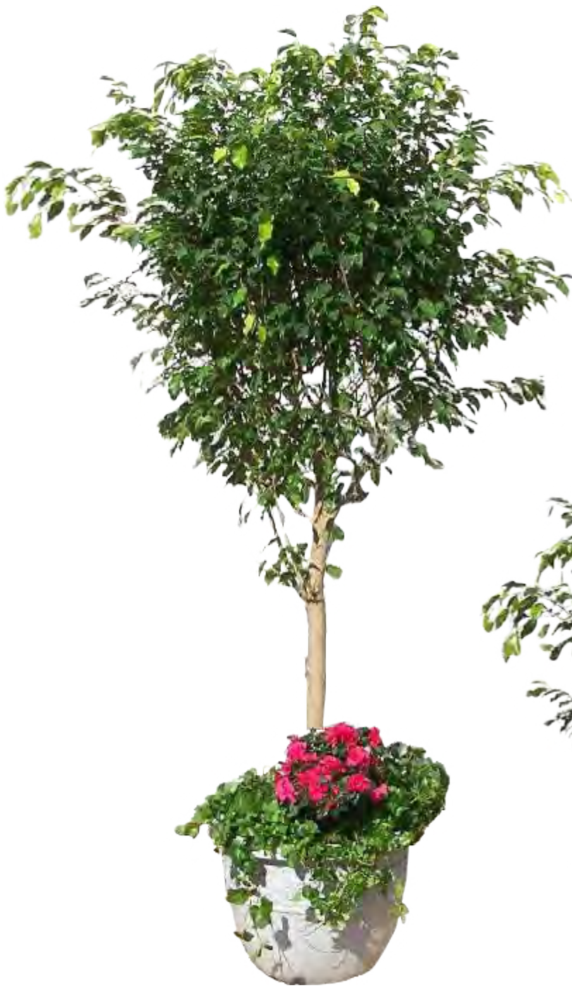
FICUS TREE WITH IVY & AZALEA TOP DRESSING