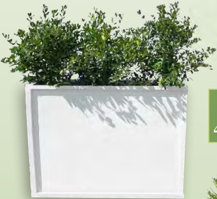
2' HOLLY WITH 4' WIDE X 3' TALL PLANTER