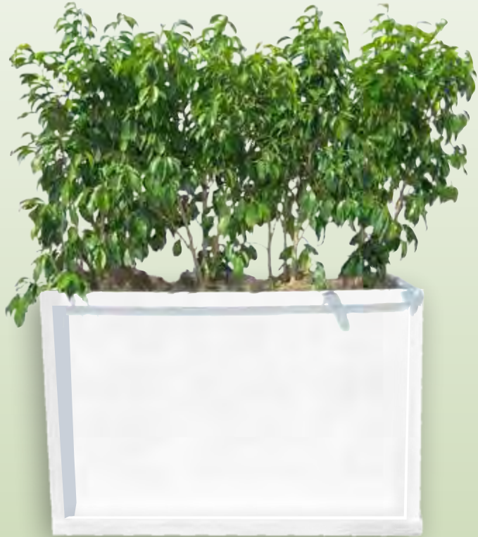
3' to 4' FICUS BUSH WITH 4' WIDE X 3' TALL PLANTER