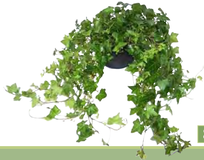
8" LARGE IVY