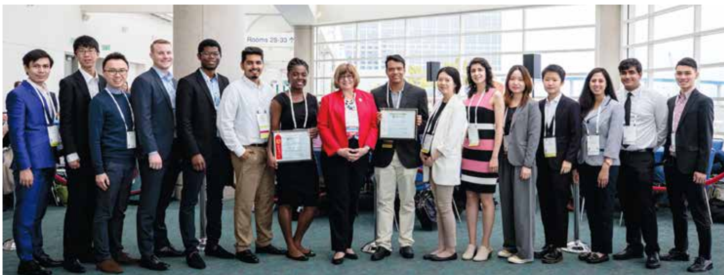
DIA 2019 Student Poster presenters.

It's more about what I can do for DIA in the future, because what we do for DIA as volunteers comes back to us multiplied severalfold. I want to contribute in some ways to promoting better health for patients, within and outside of DIA.