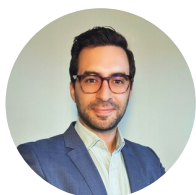
Panel Discussion with Q&A