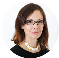
Panel Discussion with Q&A